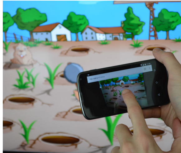
(d) Interacting with the screen through the camera viewfinder.