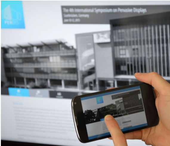
(c) A touch-enabled miniature view in full-screen mode.