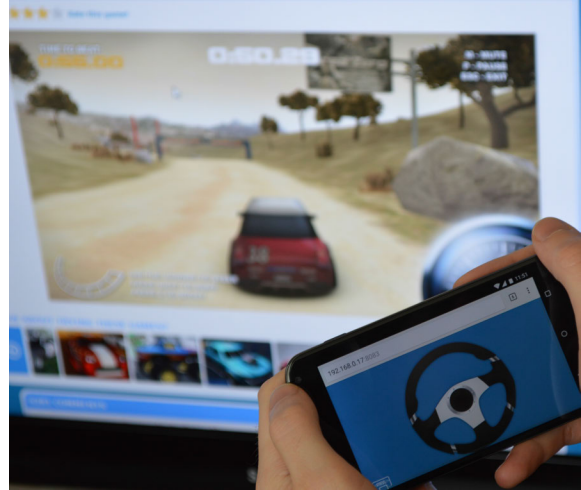
(b) Steering a racing car by tilting the device.