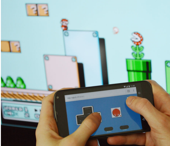
(a) An on-screen gamepad to control a platform game.